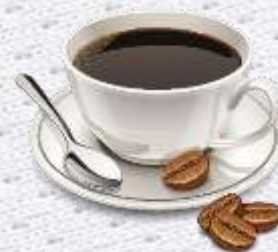
REGULAR COFFEE, DECAP COFFEE, HOT TEA