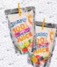
ASSORTED JUICE BOX